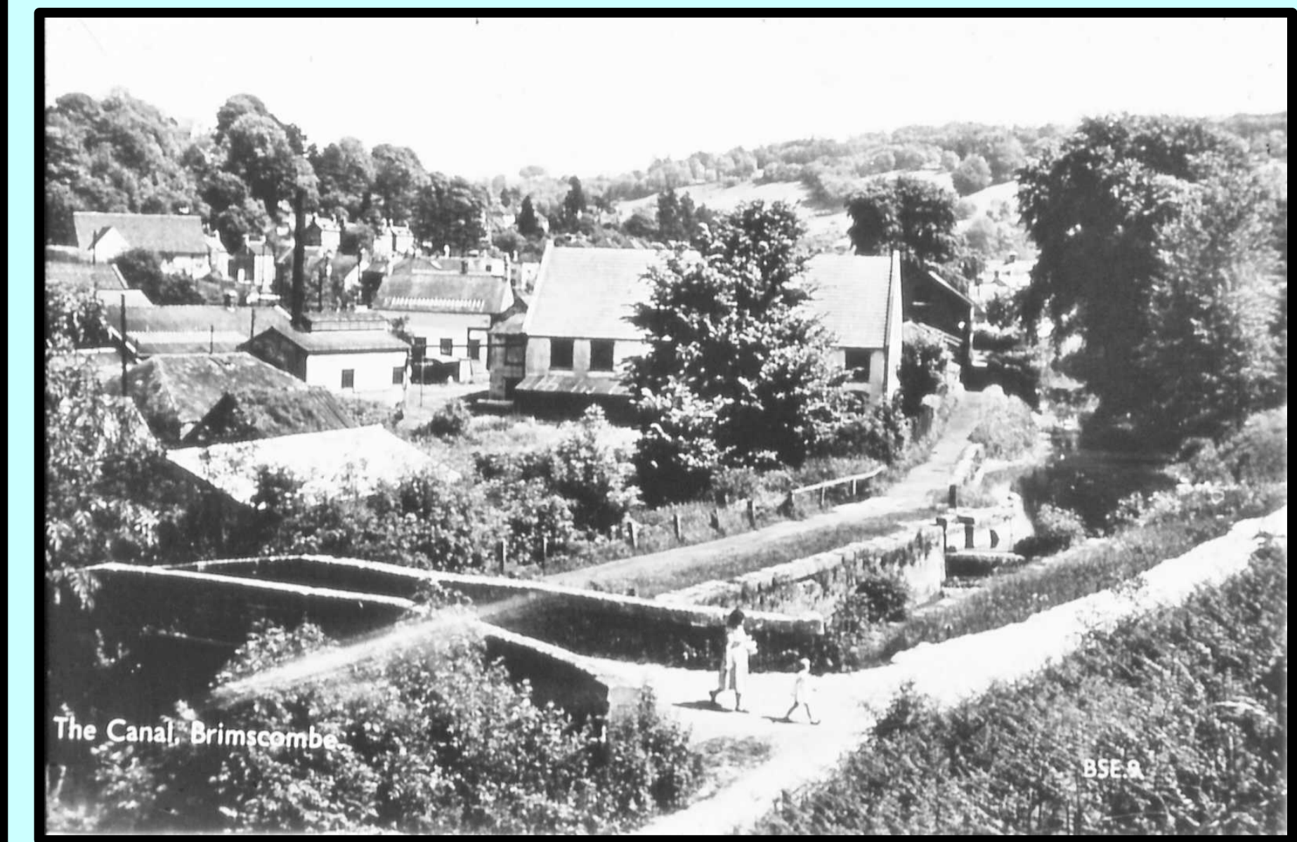
Gough's Orchard Lock after closure in 1933 but before the 1960/70s infilling

They remain the great missing link in Britain's waterway network and their restoration is a national priority.