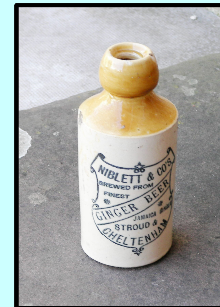
One of the many bottles found so far