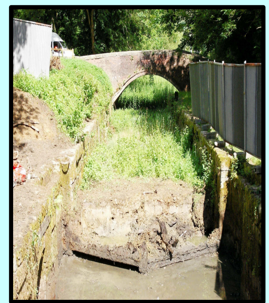
Remains of a top gate and sill